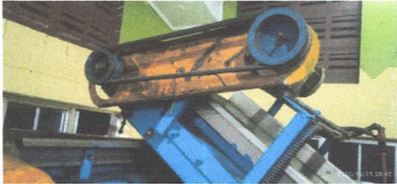
Before fixed belt cover