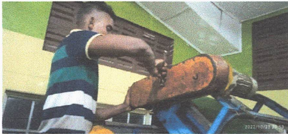
After assembling of belt cover